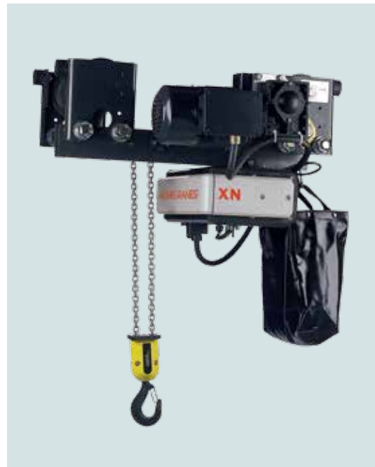
XN hoist with low headroom trolley