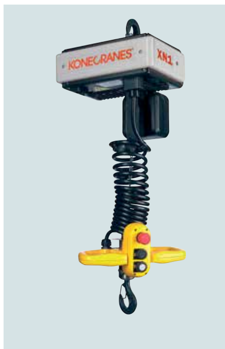
XN hoist equipped with handix