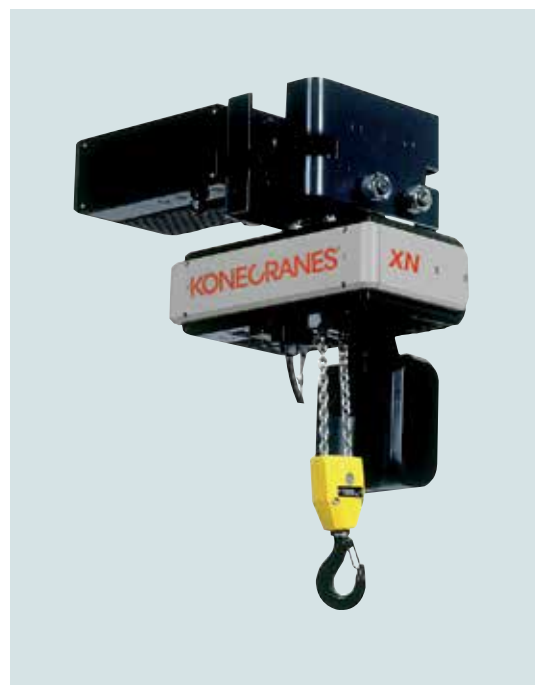
XN hoist with motor trolley