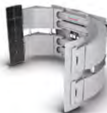
Concrete tube clamp (different versions)