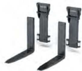
Fork shaft system, pin-type