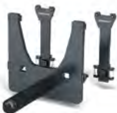
Single coil ram with fork shaft