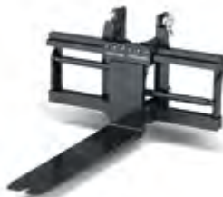
Carriage with kissing forks for steel handling