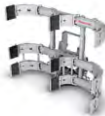
Multiple paper roll clamp (single or double)