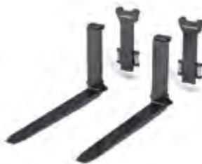
Fork shaft system hook-type