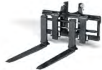
Carriage with fork shaft system (multi-function), pintype and hook-type versions