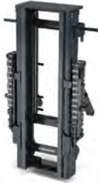
Duplex, 2-stage with freelift