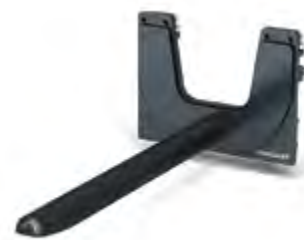
Single coil ram, integral version