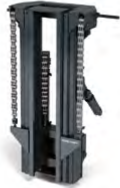
Triplex, 3-stage with freelift