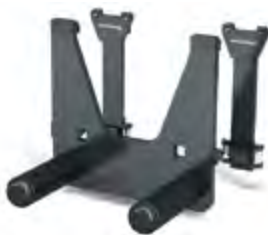
Double coil ram with fork shaft