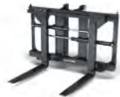
Carriage with reinforced forks for round cargo