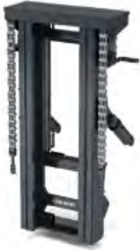
Duplex, 2-stage, no freelift