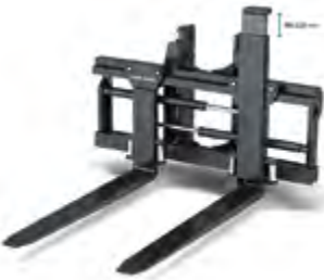
Carriage with one leveling fork (up/down) for sensitive cargo like sawmill products