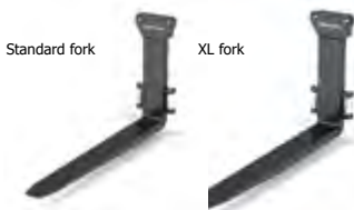
Standard fork XL fork