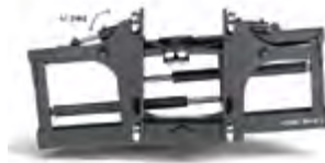
Carriage with center leveling (2 forks) for sensitive cargo