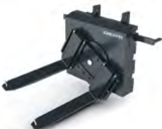
Fork rotator carriage