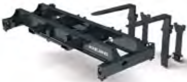
Different container spreaders with inverted forks and fork shafts