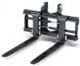
Standard carriage with integrated forks, sidsheft, and fork positioning