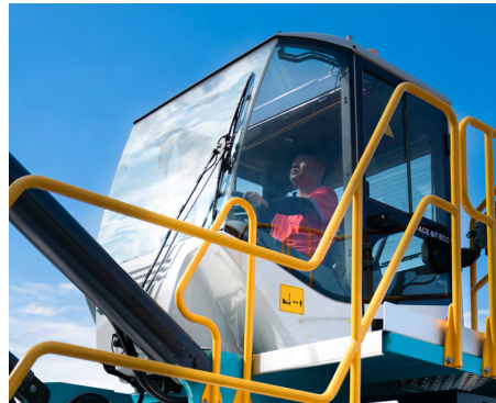
A panorama roof window and large, lowered windows with no corner posts lead to superior visibility.