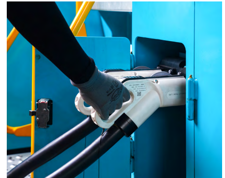
Double connector for quick charging.