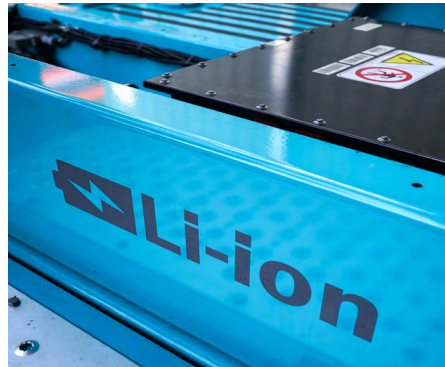
Operational time between 9–12 h thanks to powerful Li-ion battery packs.