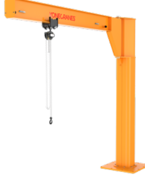
Underbraced I-beam with a manual chain hoist.