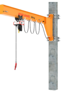
Underbraced, wall-mounted, I-beam with a Konecranes C-series electric chain hoist.