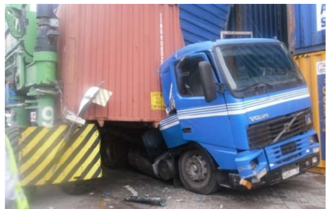
Figure 5 – Possible consequences of a spreader colliding with a container stack

A single collision can be very expensive: one fallen stack has the potential to injure personnel, damage goods, and lower the reputation of the business. Stack Collision Prevention is a wise investment to help ensure the safety and security of a busy yard.