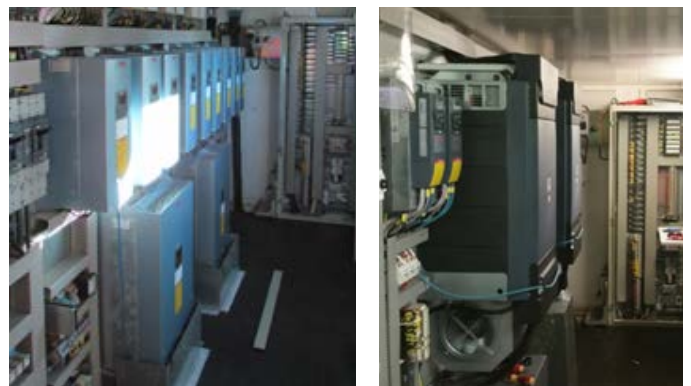
Figure 1 – RTG electrical room before (left) and after (right) a drive and control system retrofit

Optional extras in the drive and control system retrofit are: