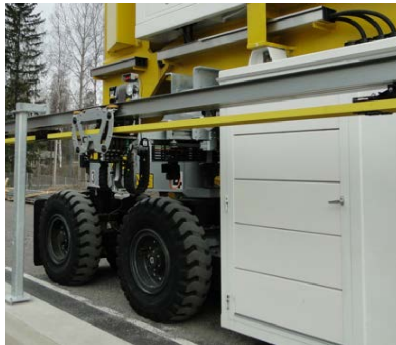
Figure 7 – Electric RTG (e-RTG) with busbar

The busbar and cable reel retrofits are the two main ways to convert an RTG crane to fully electric operation. A busbar retrofit needs a lot of yard modifications, including an electrified fence down the side of the yard, feeding points and other technical changes. For this reason, it is recommended for large terminals with a lot of cranes. On the other hand, most of a cable reel retrofit is attached to the side of each crane. The cable reel retrofit is recommended for small terminals.