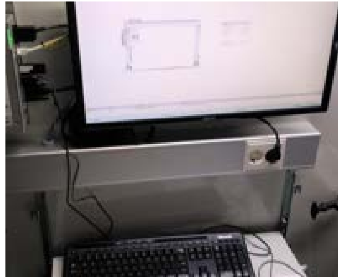
Figure 2 – Obsolete diagnostic display (left) and new CMS (right)

Other retrofits, such as safety, automation and power supply systems, can function as additional options for the drive and control system retrofit. The modular design of these retrofits make them easy to integrate into the general crane control and diagnostic system.