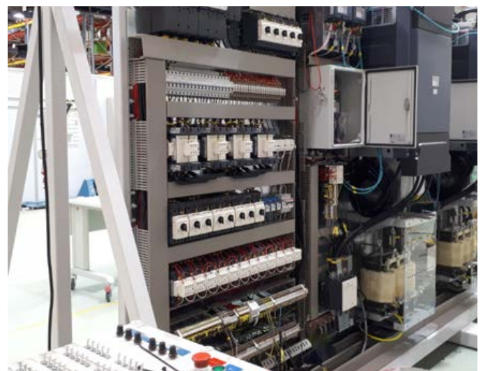
Figure 3 – Electrical panels on testing stands at the Konecranes factory

A drive and control system retrofit is an efficient and economical solution. At only 15-30% of the price of a new crane (depending on the options), a customer gets a crane with new, modern control and diagnostic systems, remote monitoring functions and full spare parts support from Konecranes. It uses high-speed standard data transfer via Ethernet and Profinet, and a modular PLC software structure allows smooth integration with other systems. For example, a crane could be connected via Ethernet with the terminal operating system (TOS). This lets the TOS exchange data with the crane, which is the first step towards terminal automation.