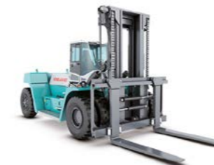
Fork lift trucks, 37 to 65 tons

Power Drive is available for all Konecranes heavy duty lift trucks that uses a 1.1 liter engine from Volvo.