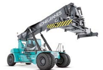
Reach stackers for intermodal handling, 41 to 45 tons