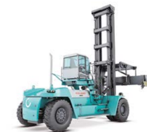
Laden container handlers, up to 45 tons