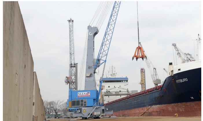
Backbone and backup: the HMK 330 EG can quickly come to the aid of the G HMK 6507 B as soon as the situation requires it.