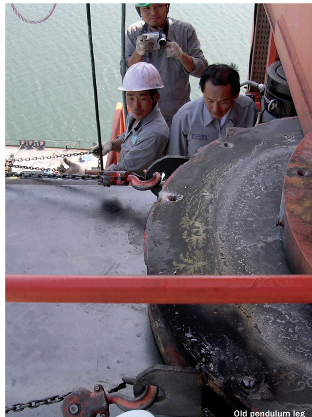
Old pendulum leg