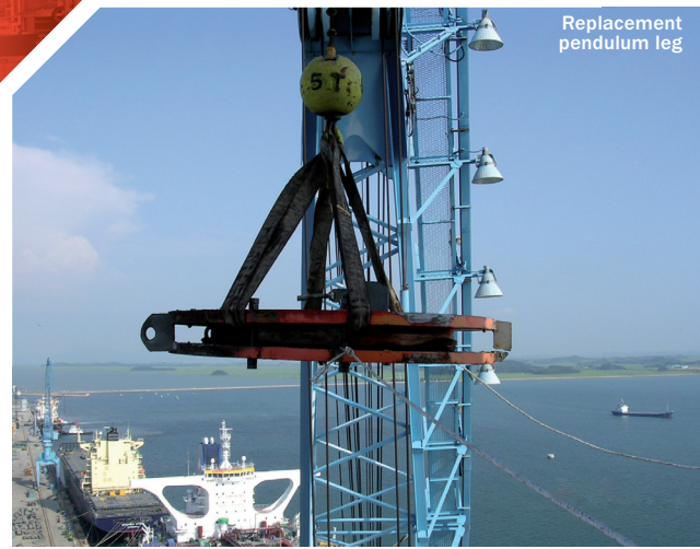
Replacement pendulum leg